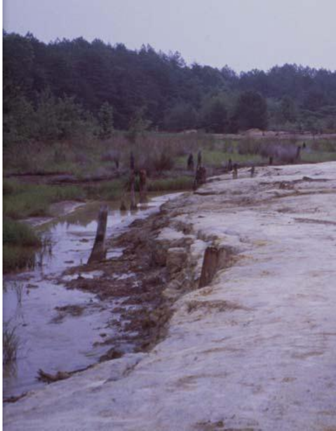
Figure 1-2. Photo of Valzinco mine tailings.

Based on a baseline assessment of seasonal variations of acid and metal concentrations in Knight's Branch, (performed by the U.S. Geological Survey [USGS], U.S. Environmental Protection Agency [USEPA]), the acute and chronic water quality criteria for aquatic ecosystem health were exceeded due to acidity and high dissolved metals concentrations (iron, aluminum, zinc, lead, copper, cobalt, and sulfate). The pH of the water in Knights Branch ranged 2.6–3.9, well below the ambient pH typical for the Virginia Piedmont region, and mean concentrations of a number of metals in the stream were one or two orders of magnitude above USEPA criteria. Approximately 11 acres of on-site land were almost completely barren, vegetation was sparse to nonexistent, and woody vascular plants rarely survived for more than a year on the spoils (Seal et al. 2002).